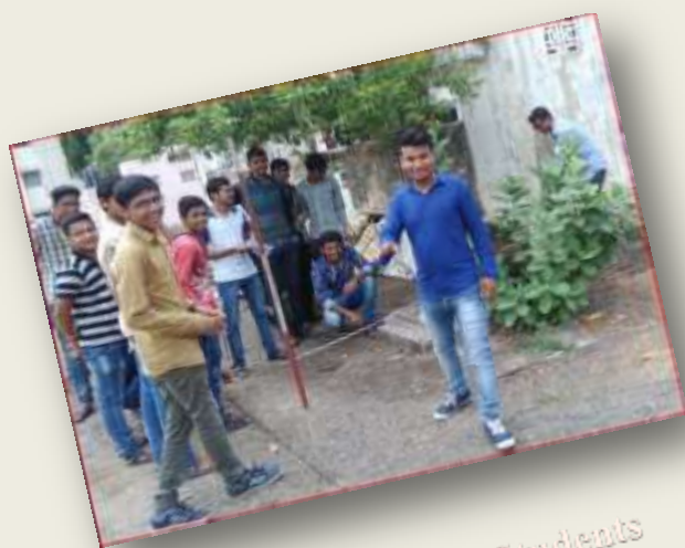
Field Visit of Students